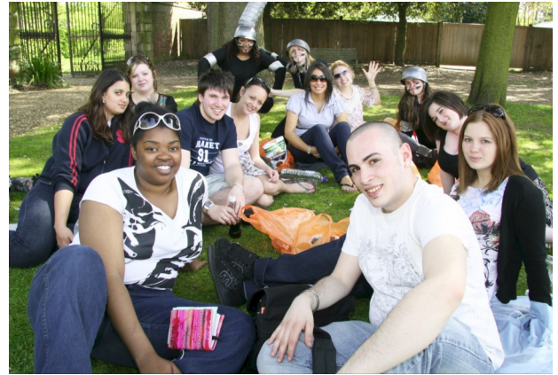
St Mary's University College student facilitators at a workshop at Ham House & Garden (2010)

July 2014: Reflective projects begin, including academic conferences, the publication of papers, and the analysis of impact assessment outcomes.